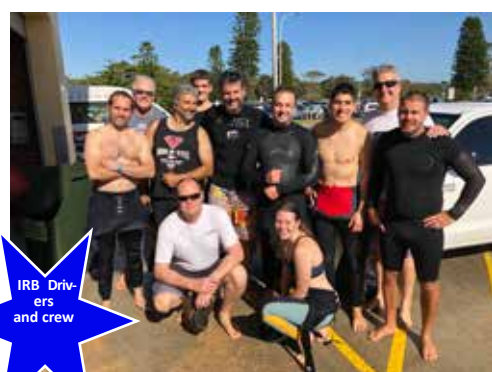
IRB Drivers and crew

Our patrols have also been bolstered by 14 exceptional candidates who completed Silver Medallion awards this season. We have 4 new members with Silver Medallion Aquatic Rescue, 2 with Silver Medallion Advanced First Aid, 3 new Patrol Captains and the 5 IRB Drivers mentioned previously. It is fantastic to see so many members completing higher awards.