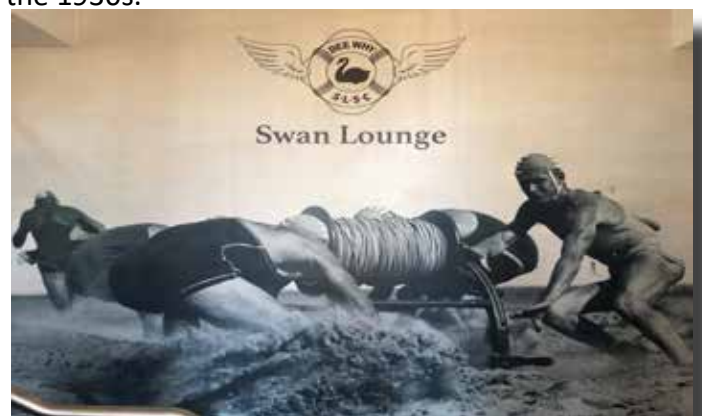
Swan Lounge entrance mural