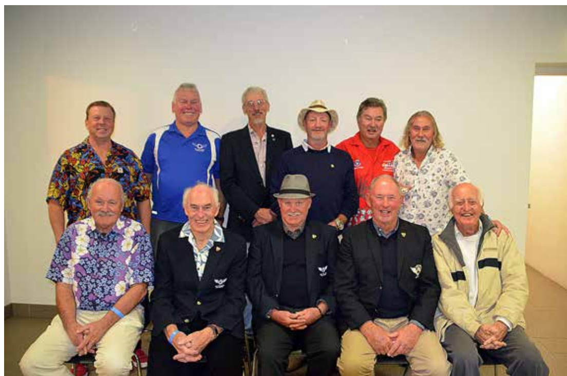
Life members at the Presentation Evening