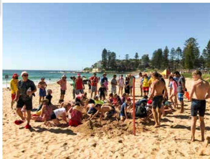
Christmas Day Plum Pudding Hunt

On the social scene the club held the usual scheduled events which include the Friday evening BBQ in the Betty Barry room, the Nipper Halloween Party, Club Christmas Party and the Christmas pudding hunt.