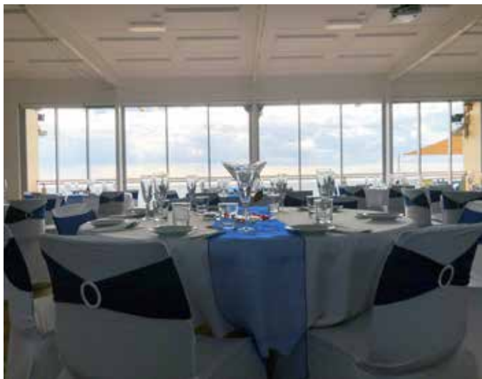
Swan Lounge function hire

The gym received a new rowing machine and exercise bike.