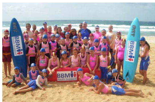
BBM Junior Development Camp

This year due a communication breakdown within the club we did not hold the JDC over the Australia Day long weekend as we have done in previous years. So instead a very small group went to Orange to celebrate Australia Day in the country. The benefits of the Junior Development Camp cannot be underestimated as it provides both Dee Why Nippers and Orange Bush Nippers with great experiences. This year Dee Why Nippers had the opportunity to experience Royal Life Saving skills from the dedicated team at Orange. The children were provided with training in survival strokes, handling life jackets and how to escape from under an overturned sail boat. We stayed in town at the Scout Hall which is something we had never done before and those