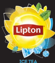
Lipton Ice Tea