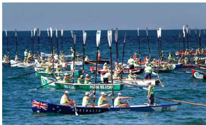
100 Boats for 100 Years at Collaroy

Later the same day, two of our boats were involved in the 100 Boat Gallipoli landing simulation at Collaroy beach. Both of these events attracted crowds of thousands.