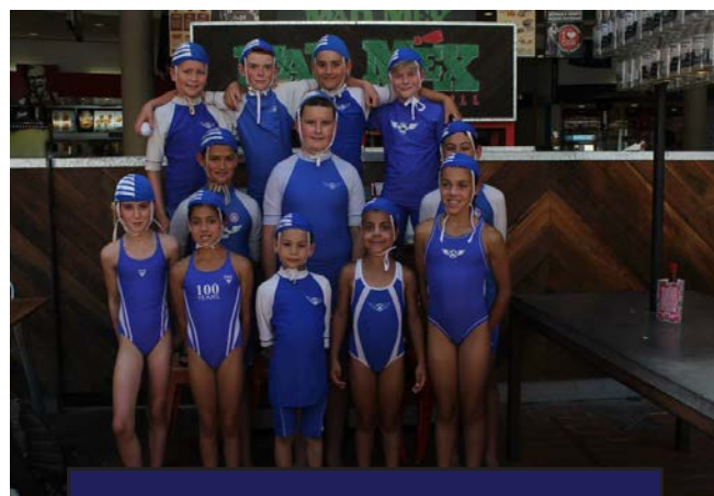
Santa Parade Westfield Warringah Mall