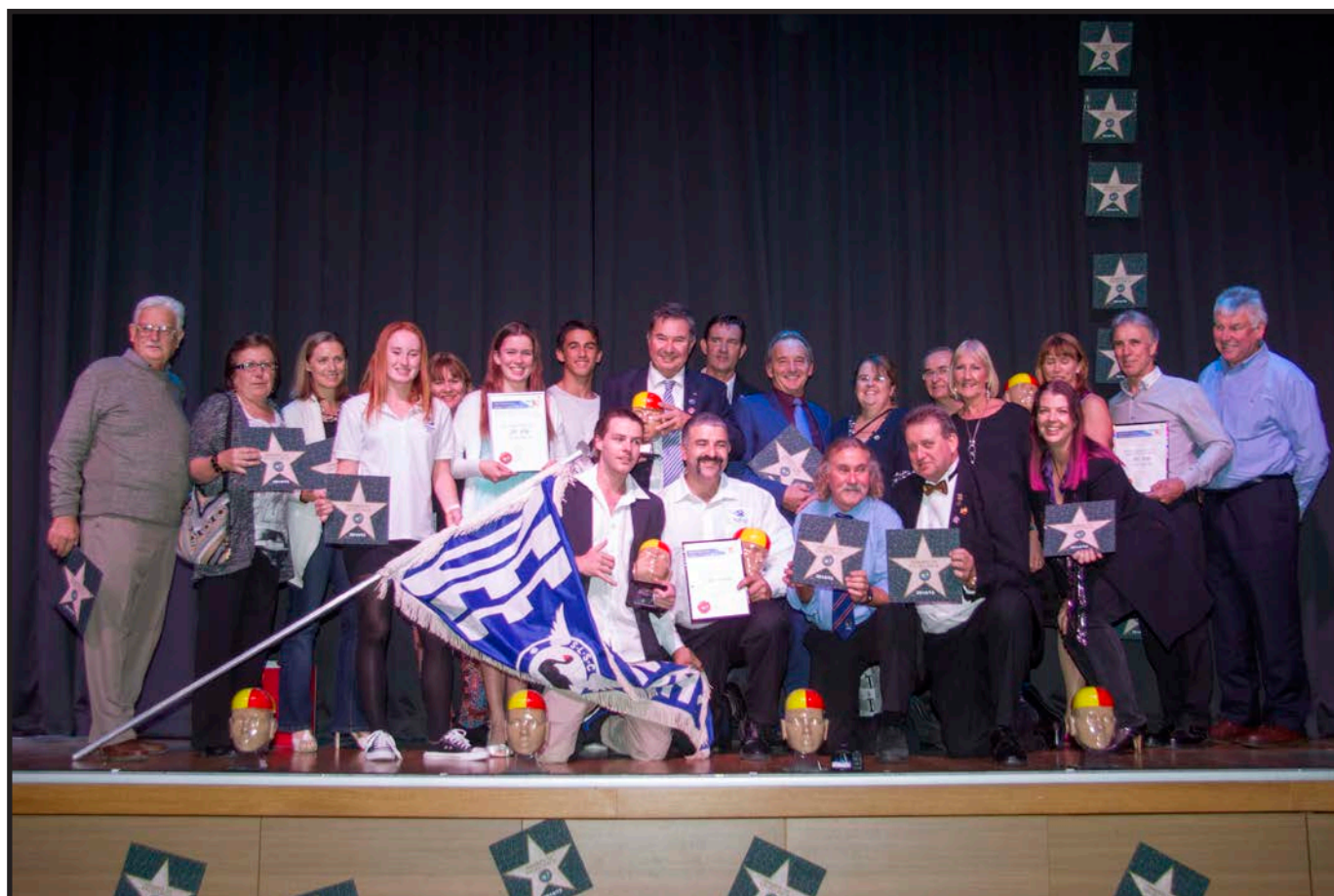
Dee Why Members receive the 2014/2015 Most Outstanding Club Award