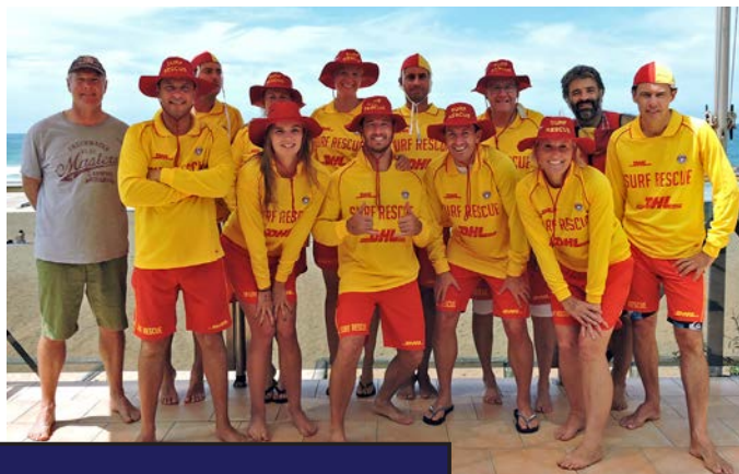
Nipper Parent Bronze Group

We are always looking for new members to do their Bronze that have a vested interest in the club. This season a special course was tailored to cater for our Nipper parents that wanted to become role models to their children and help out more. Several of the candidates were somewhat inexperienced in relation to the surf environment. All the candidates worked very hard to achieve their goal and overcome obstacles during the course whether it was achieving the pool swim time, board skills and negotiation the break or getting their resuscitation aid first aid up to standard. The group all proudly achieved their Bronze Medallion and will strengthen the patrolling and volunteering base of the club