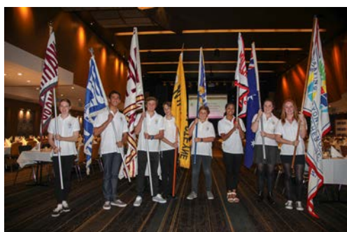
Above Junior Lifesaver of the Year members at Sydney Northern Beaches Awards of Excellence