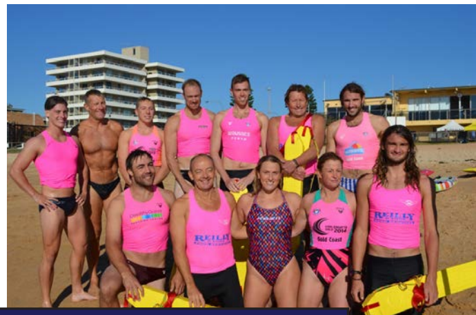
Gold Medallion members at the Assessment

completed the Gold Medallion assessment consisting of several tasks. An 800m timed swim in under 14 minutes. To complete "the Mission" in under 25 minutes which entailed a 400m ocean swim, 800m run on the beach, 400m board paddle through the surf and finishing with another 800m run. A complex board and tube rescue in the surf followed by a scenario testing all their skills and their ability to remain calm and act in a difficult situation. All the members proved well and truly prepared up to the task and proudly represented Dee Why.