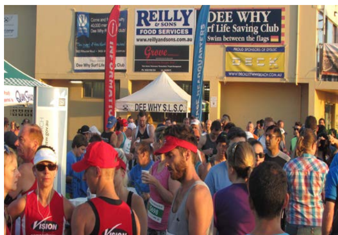
Sun Run and Sponsor Banners on the Club Wall