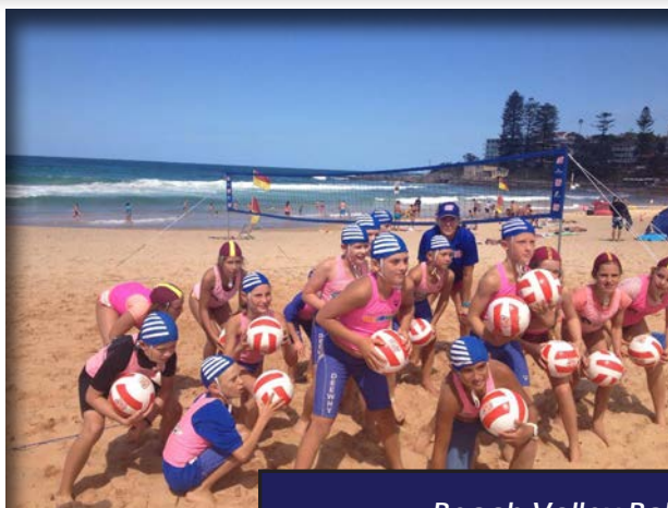
Beach Volley Ball