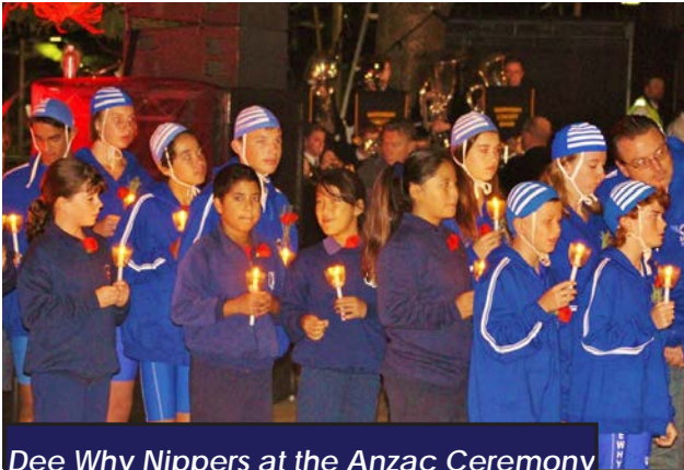
Dee Why Nippers at the Anzac Ceremony at Dee Why beach

At 5:30 a.m. on ANZAC Day twenty of our junior members participated in a ceremony at Dee Why Beach each carrying a candle and a plaque with an inscription.