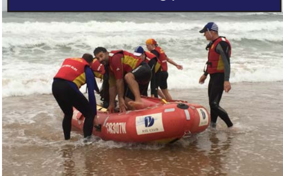
Patient Handling practice

During the off-season we have continued with upskilling training or race training almost every Sunday morning 7.00 – 9.00. Anyone is welcome to come down and participate if you have your crew or driver proficiency, and if you haven't but want to find out more please come and chat to any of us. With a new influx of keen participants the Black Ducks (our racing team)