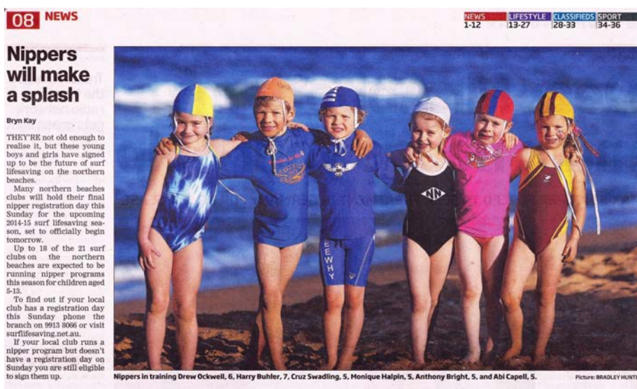
Manly Daily September 2014