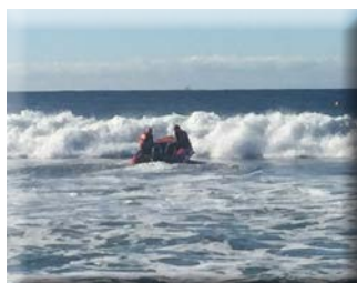
New IRB drivers in Assessment Conditions

For the first time since 2002 a group was put through their Gold Medallion assessment. A group of youth and senior members were handpicked and asked to start the journey towards attaining the highest award in surf lifesaving. After the arduous task of ensuring that all pre requisite awards were up to date, current and proficient the members were put through several training runs to ensure that they were aware of the physical challenges ahead of them. A total of 8 members (a proficiency for 2 of them) successfully