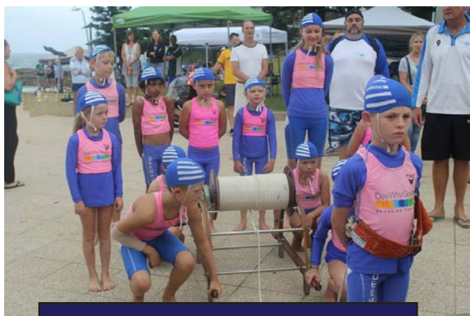
Australia Day 2015