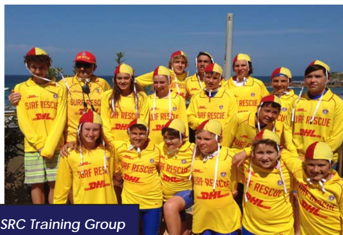
SRC Training Group

many stepped up to do additional patrols and water safety whenever asked and managed to exceed 100 hours of patrolling.