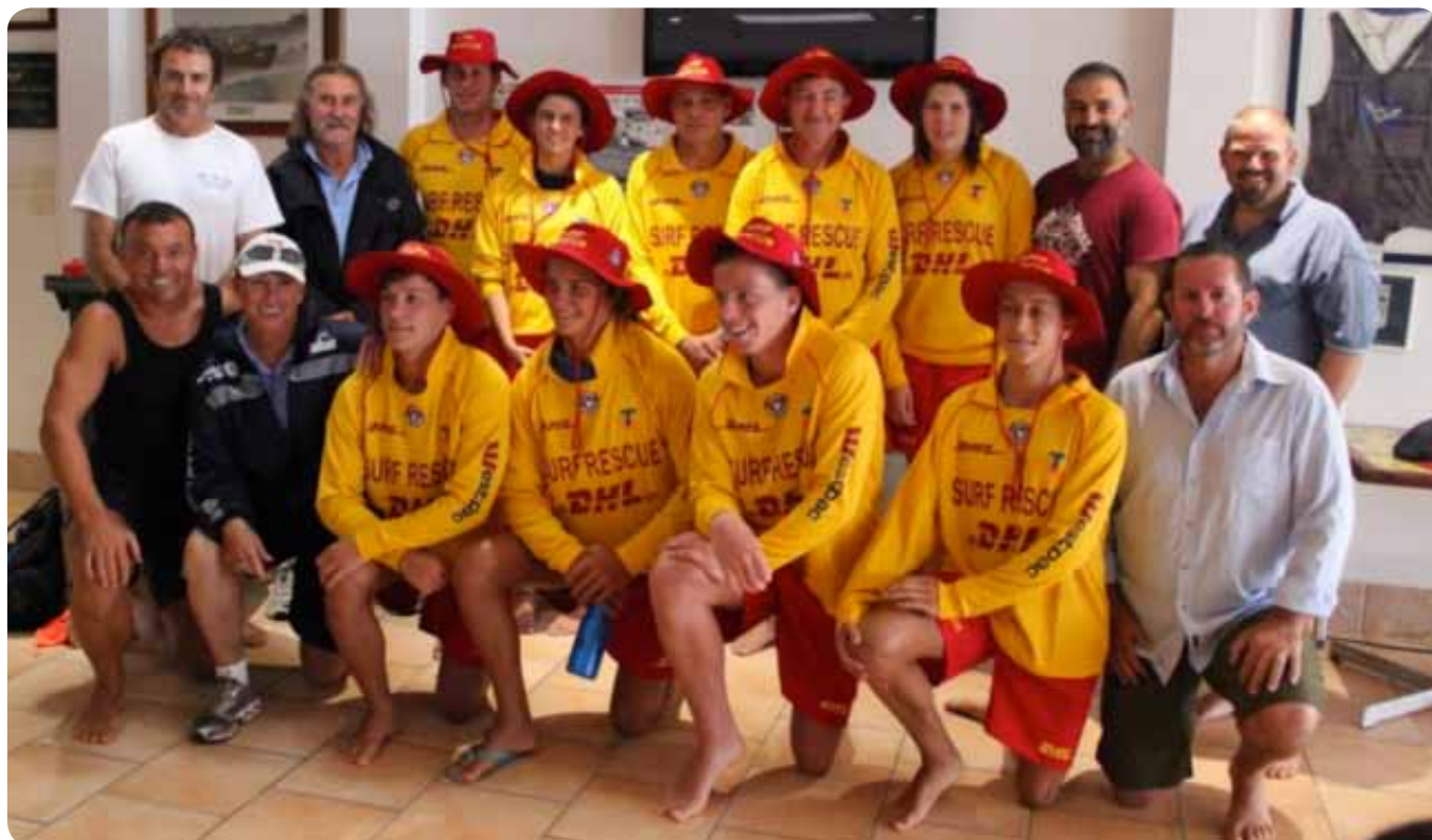
Bronze group from Orange and Dee Why with Trainers

Aside from this achievement there were all the up and coming juniors that participated in the camp, some 50 odd from Dee Why and 20+ from Orange ranging from the ages of 5 to 13. With the assistance of our many enthused helpers and experts in their field, the program was a great success. Our cadets also joined in to help and run activities and take on some responsibility. The nippers from Dee Why and Orange all responded well to their youthful approach and invaluable knowledge. All the nippers learnt skills on the beach and in the water. Our visitors from Orange joined in on the Sunday nipper events and due to atrocious conditions on the final day of the camp we were bound to the beach. This did not dampen the enthusiasm of the team leaders or the participants who ran through first aid and Resuscitation scenarios along with an introduction to the IRB and some dry land skills.