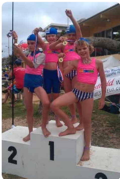
U9 Beach sprint relay team, Gold at Branch Championships