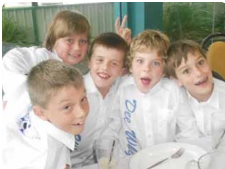
U9 Boys waiting for the next event at state titles