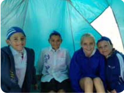
Competitors at the state titles