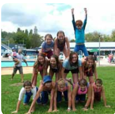
Dee Why Nippers at the BBM JDC in Orange