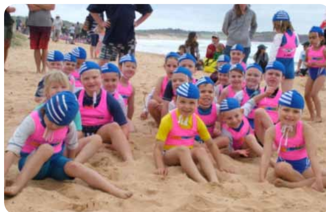
New Pink rash vests for all nippers on Dee Why beach sponsored by Dee Why Grand