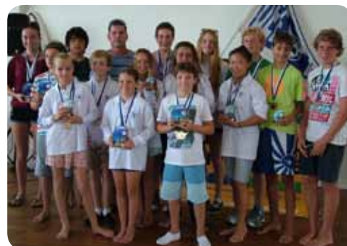
Iron Person Awardees