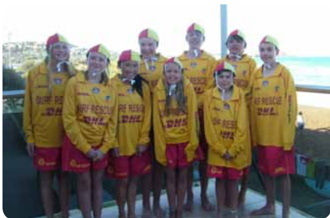
SRC Candidates on the beach after their final exam and in their well earned patrol uniforms

Once again this season all of our U14 nippers took the first step into the senior club by successfully completing their Surf Rescue Certificate (SRC). This was held over the October long weekend when the water was cold and the conditions challenging. We had candidates that had been nippers since U6s and new members that had just joined the club. They all worked together and helped each other through and followed on as patrolling members for the season fulfilling their rostered patrol duties along with water safety commitments.