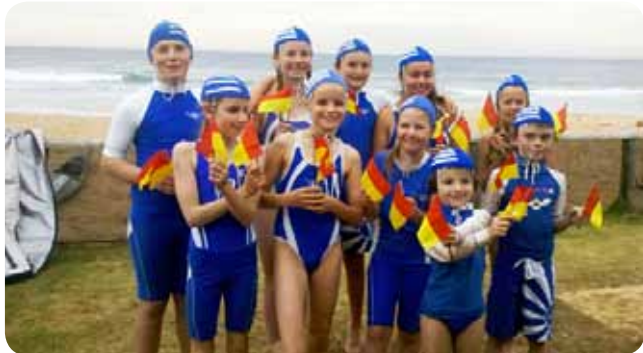
Dee Why Nippers representatives at Flag raising ceremony for our Centenary Year

This season proved to be a very busy and challenging season being the clubs centenary year and with Dee Why being the host club for the branch championships. Weather and conditions proved somewhat unfavourable but our nippers and their parents stepped up and participated and helped out where required.