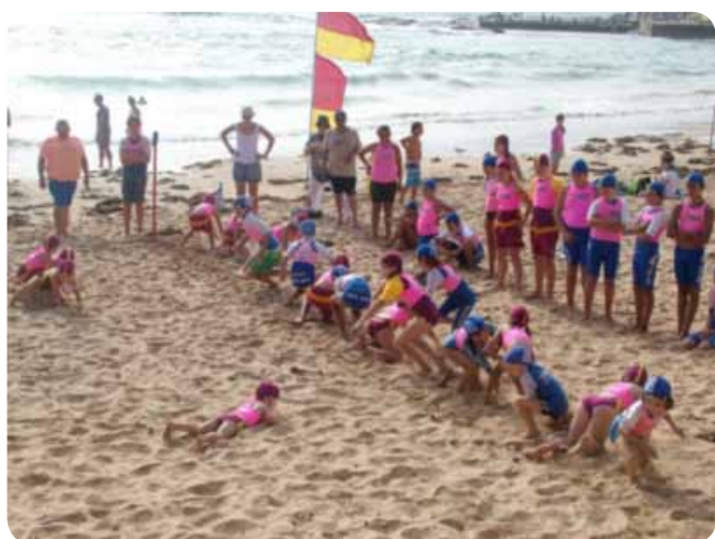
Australia Day Events at Dee Why Beach with Orange Bush Nippers and Dee Why Nippers

Aside from this achievement there were all the up and coming juniors that participated in the camp, some 50 odd from Dee Why and 20+ from Orange ranging from the ages of 5 to 13. With the assistance of our many enthused helpers and experts in their field, the program was a great success. Our cadets also joined in to help and run activities and take on some responsibility. The nippers from Dee Why and Orange all responded well to their youthful approach and invaluable knowledge. All the nippers learnt skills on the beach and in the water. Our visitors from Orange joined in on the Sunday nipper events and due to atrocious conditions on the final day of the camp we were bound to the beach. This did not dampen the enthusiasm of the team leaders or the participants who ran through first aid and Resuscitation scenarios along with an introduction to the IRB and some dry land skills.