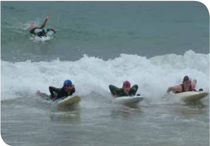
Dee Why on the lead wave