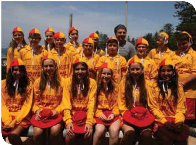
SRC Candidates on the beach after their final exam and in their well earned patrol uniforms

The season didn’t necessarily favour us for the duration. There were several days where water events at Nippers and carnivals were cancelled due to dangerous conditions. Our nippers and competitors were not put off by this and still turned up each week and had a go at whatever was available.