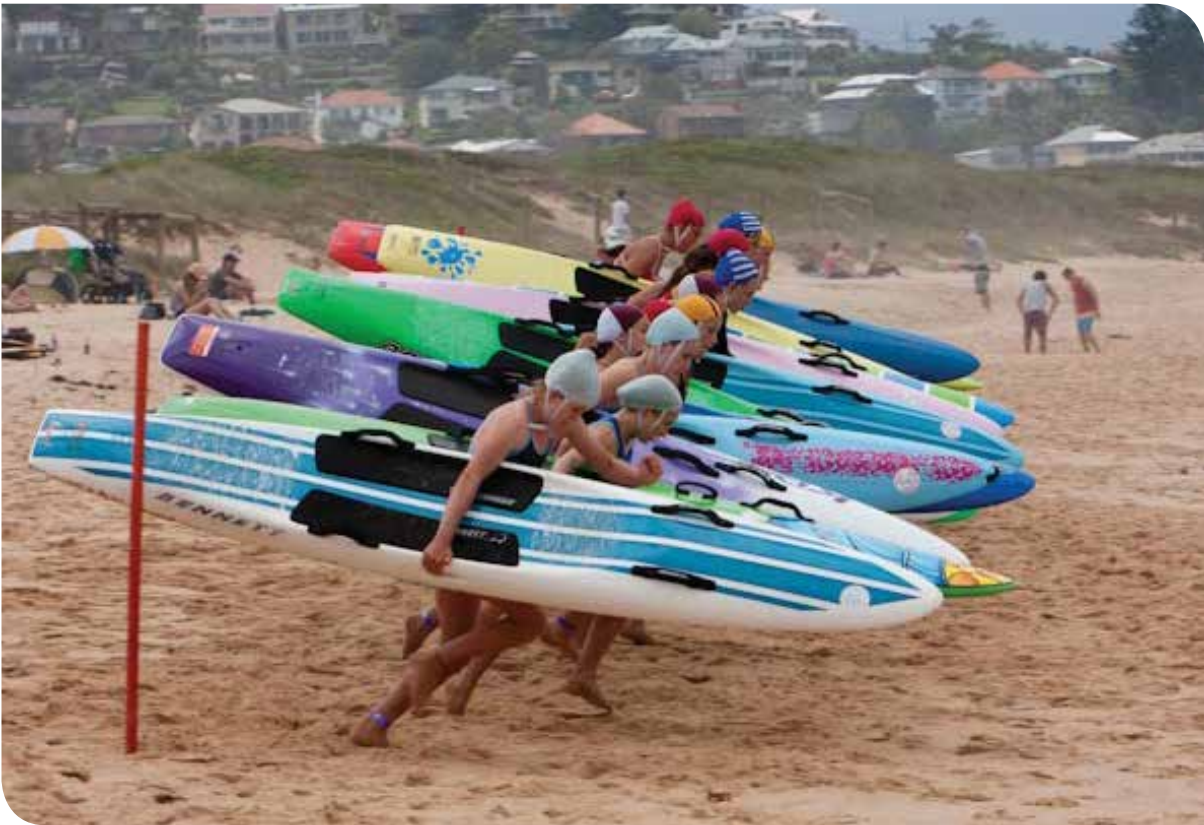
U14s Girls Board Race