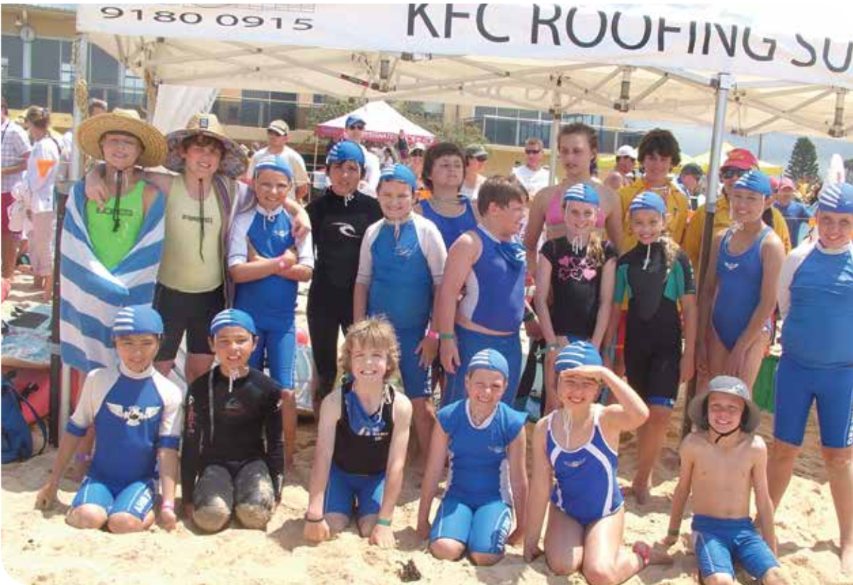
Dee Why Nippers at a carnival