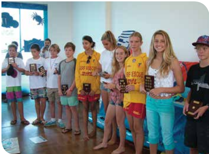
U14s group in their final year in Nippers

All of our Coaches, Age Managers and committee members are volunteers, who give up their time to enable nippers to run smoothly and I would like to thank them all for the time, contributions and continued efforts.